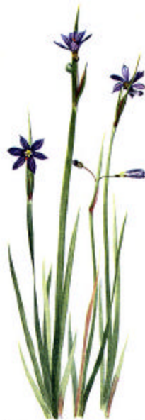
Blue-eyed Grass - Sisyrinchium angustifolium

Habitat: This perennial herb is found along the edges of woods, in damp open woods, on slopes, along stream banks, in open grassy areas, meadows, and plain prairies, Jersey Pine Barrens, grassy openings, all along the eastern seacoast and half way across the United States.